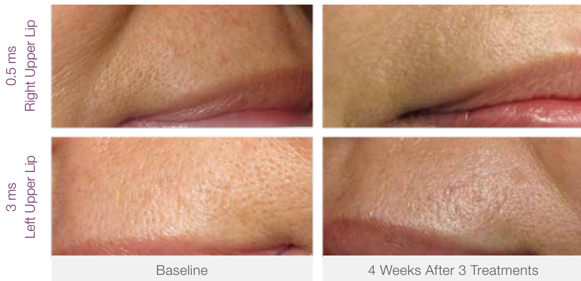
Figure 7. A 53-year-old Asian female (Fitzpatrick Skin Type IV) with fine hair (diameter of 40 \mu m) on her upper lip received three treatments with the 1064 nm Nd:YAG laser. The right upper lip was treated with the short pulse duration of 0.5 ms while her left upper lip was treated with 3 ms pulse duration (each treatment done with 1 pass). Superior outcome was obtained on the right upper lip, treated with the short pulse duration (0.5 ms), with 50% reduction in hair count, while the left upper lip did not show improvement.