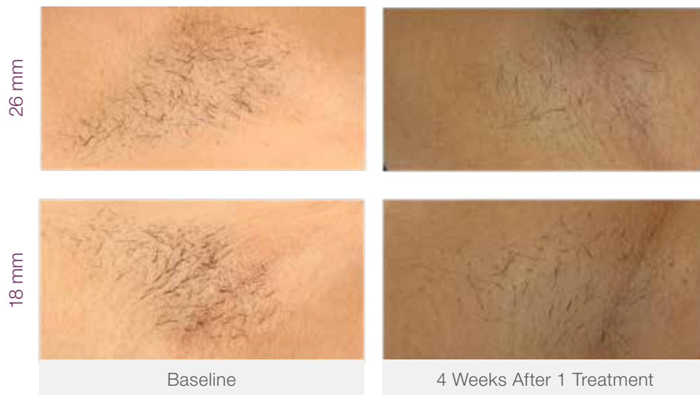
Figure 3. A 24-year-old Asian female (Fitzpatrick Skin Type IV) received treatment to the axillae with the GentleMax Pro Plus: Evidence of increased efficacy of the large spot (26 mm) vs. medium spot (18 mm) was noticed. Treatment parameters: