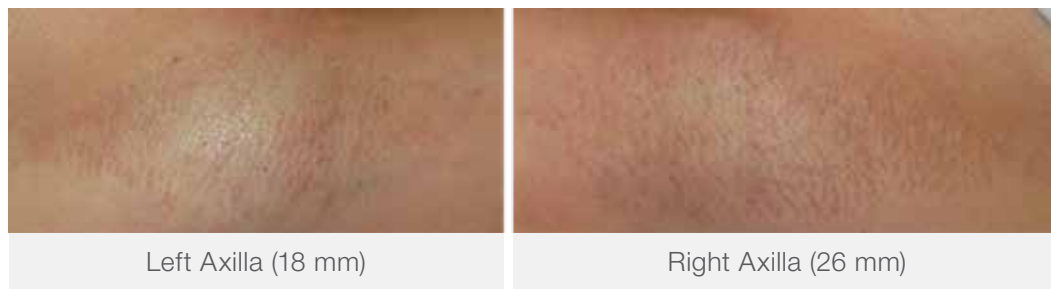
Figure 4. A forty-year-old Caucasian female (Fitzpatrick Skin Type III) received treatment to the axillae with the GentleMax Pro Plus 755 nm Alexandrite laser: Strong clinical endpoint is evident with the 26 mm spot size. Treatment parameters: