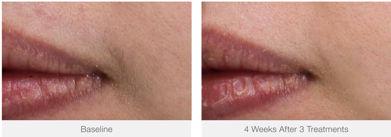
Figure 6. A 28-year-old Asian female (Fitzpatrick Skin Type IV) with fine hair on her upper lip received three treatments with 755 nm Alexandrite laser. Her left upper lip was treated with 2 ms pulse duration (each treatment done with 1 pass). Treatment parameters: