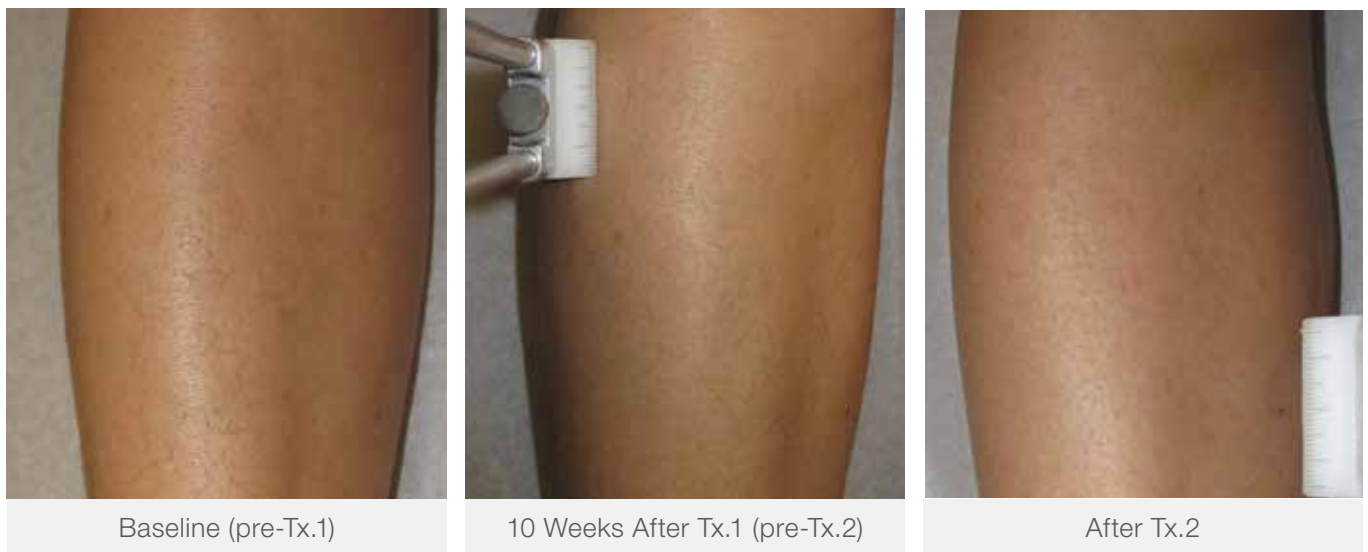
Figure 8. A 45-year-old Caucasian female (Fitzpatrick Skin Type IV) received two treatments on her right lower leg with the 1064 nm Nd:YAG laser (12 mm spot size) ACC handpiece, using a single pass and repetition rate of 3 Hz. Treatment parameters: