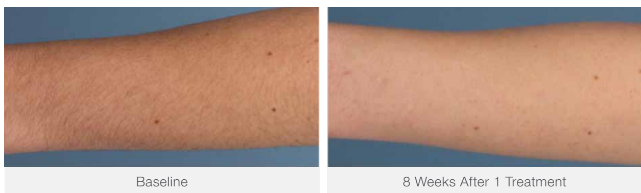
Figure 5. A 25-year-old Caucasian female (Fitzpatrick Skin Type II) with fine hair (diameter of 40 µm) on her left arm underwent one treatment using a single pass with the 755 nm Alexandrite laser (18 mm spot size) DCD handpiece. Treatment parameters: